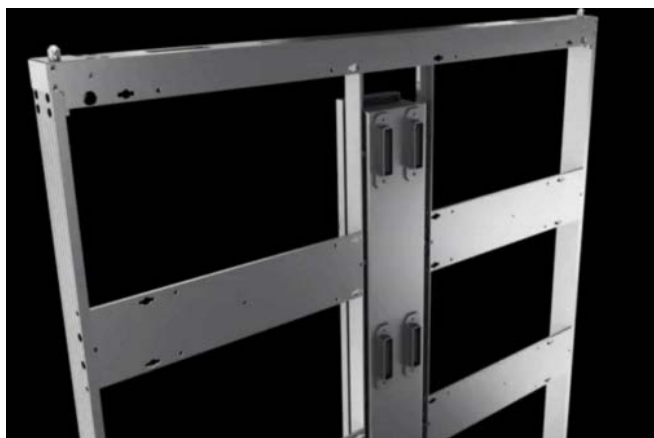
Maintenance design in front of power box