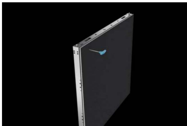
Module front maintenance design