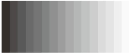
Low gray scale